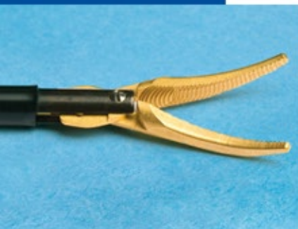
REF : * MD5 330