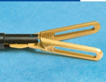
REF : F5 330